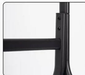
Double column design Hold up to 100kg