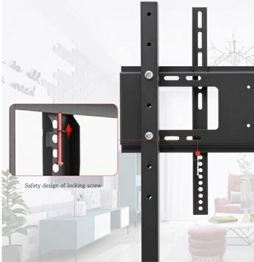
Safety design of locking screw

Locking screw safety design TV does not fall