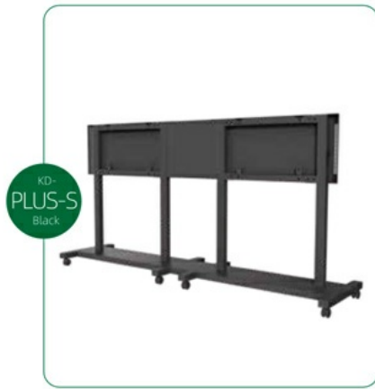
A: back view