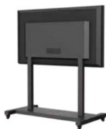
A: back view