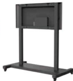
B: front view