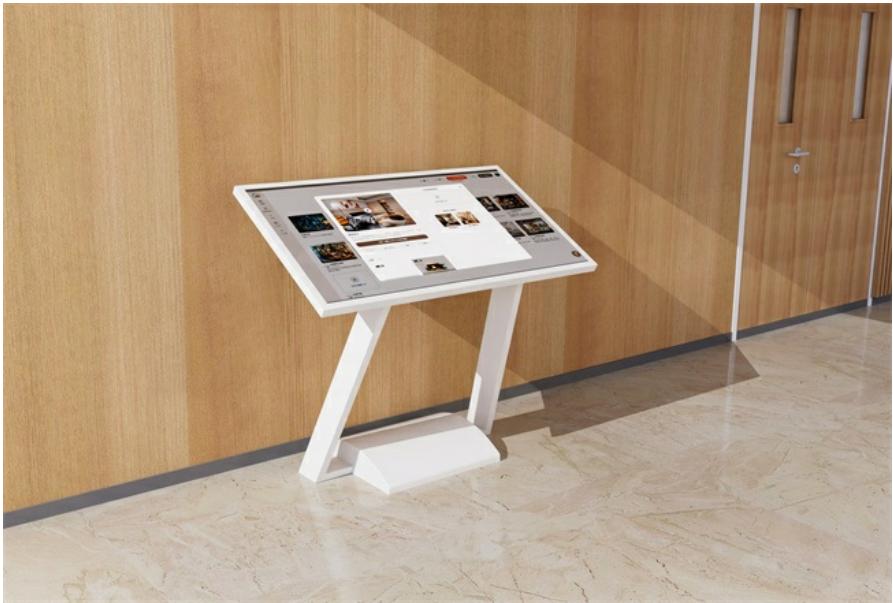
Hot Sale Floor Standings