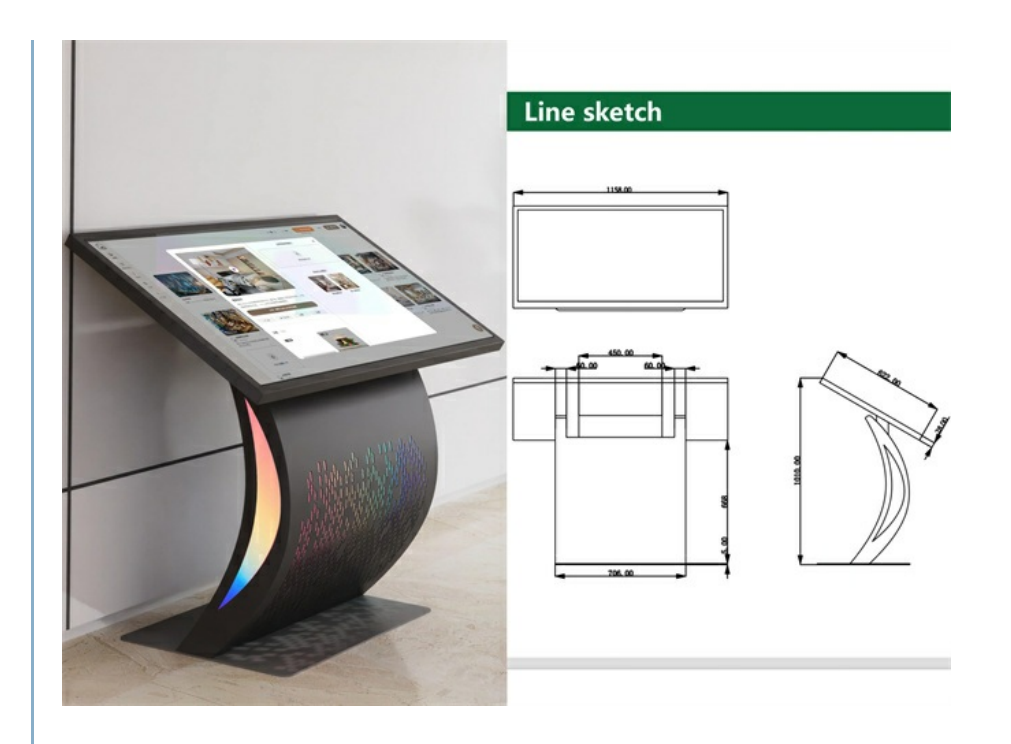
Other New Design Advertising Stands