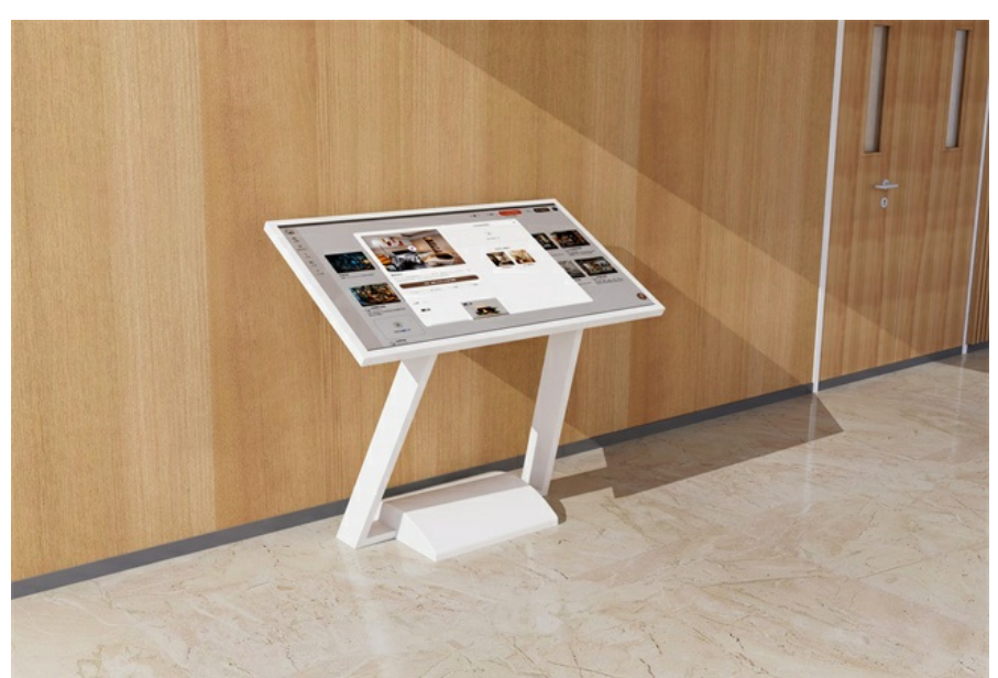
Hot Sale Floor Standings